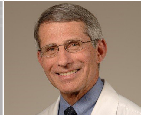
AHA Hosts Call with Dr. Anthony Fauci on COVID-19

As we look ahead to 2021 we are preparing for another year of challenges. We will build on the lessons we've learned, and your continued support, to maintain our commitment to advancing health in America.