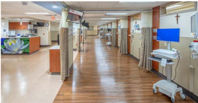
Cardiovascular Access Unit