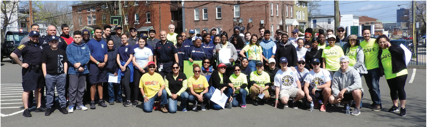
Area residents participated in a neighborhood cleanup.

Connecticut Children’s Medical Center, Hartford Hospital, and Trinity College | Hartford, CT